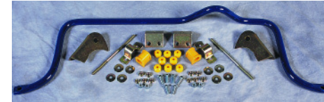
Range Rover Classic Rear Anti-Sway Bar Kit (BA034)