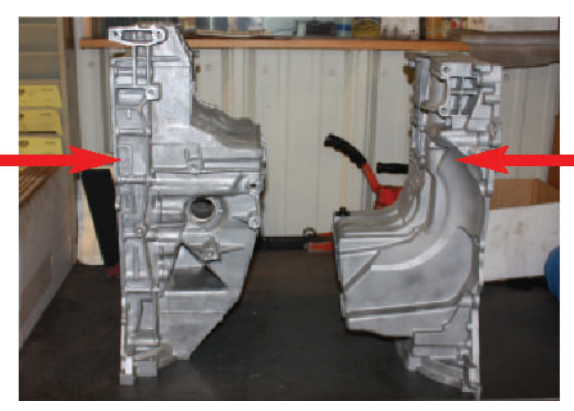
6. Oil Pan for LR3 or Sport (Good with no holes or cracks)

6. Oil Pan for HSE (Good with no holes or cracks)